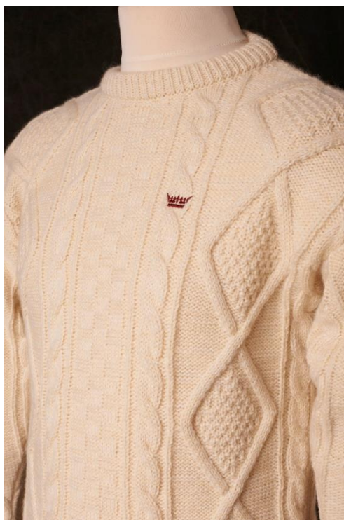
ARAN / RED CROWN