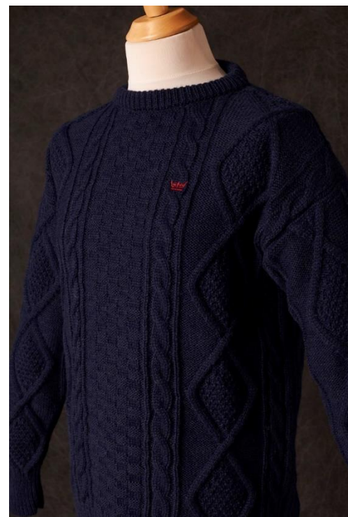
NAVY / RED CROWN